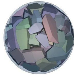
Fig.3. Local optimal placement of polyhedral spherical container

Figure 3 shows the local optimal placement of convex polyhedra in spherical container found by our algorithm.