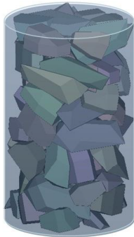
Fig.2. Local optimal placement of polyhedral cylindrical container

Figure 2 shows the local optimal placement of convex polyhedra in cylindrical container found by our algorithm.